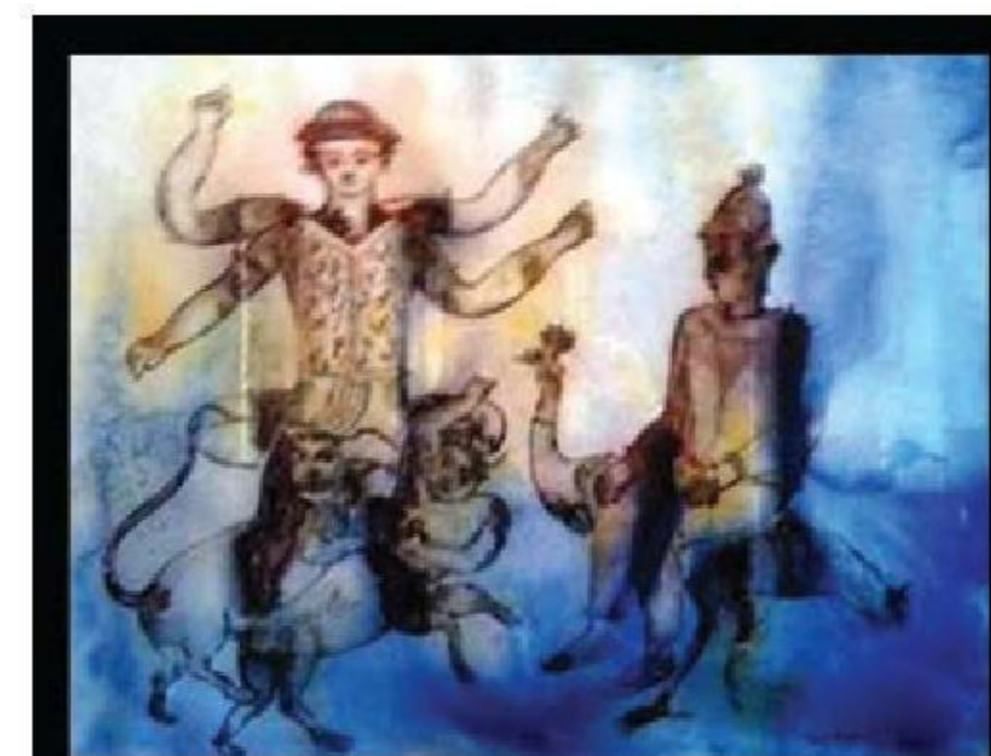
Observe contemporary artist Sakti Burman's art with its mythic and fantasy content and rich colors.

Don't feel intimidated to talk about art. Share how you feel, because your opinion is a valuable one. Remember, the more you look, the more you will see. Discuss different works of art with likeminded family and friends. Join the elitist club of art lovers, have fun and remember that talking about art can be cultivated and developed. Go ahead and acquire the skill.